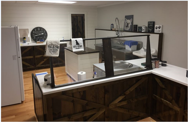
Roll-Over Ice Cream coming soon - 168 E Main Downtown Morehead!